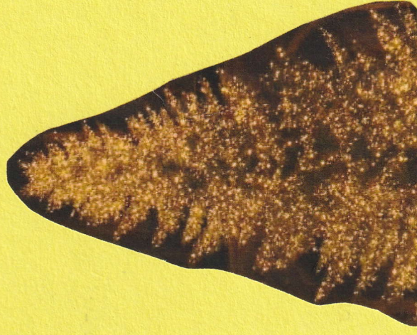
the christmas trees in the UK are to 10 m high